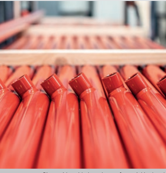
Pipes with welded on sleeves for sprinkler heads

The raw material is first blasted with a bright metallic finish and then circumferentially welded using the MAG (metall active gas) welding process. Subsequently, the pipes are cut to the required length. This means that there is almost no waste or scrap, which is very resource and environmentally friendly. In order to connect the pipes with couplings, the grooves are rolled at their ends. A plasma cutter cuts holes into the pipes. The sleeves for the sprinkler heads are then welded onto these using a VdS-approved sleeve welding process.