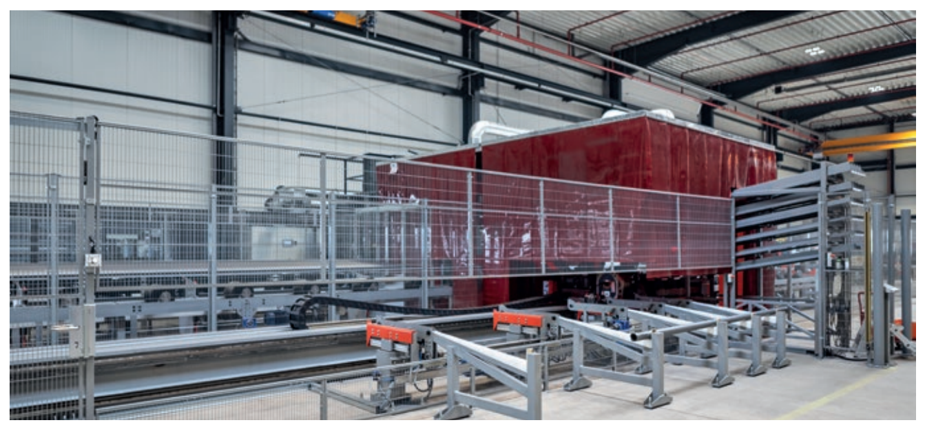
Robot welding system outlet

At its Mogendorf plant in Germany, Rosenbauer operates its own state-of-the-art pipe prefabrication facility, which combines robotics with cutting and welding technology. It is extremely flexible, efficient, and environmentally friendly. Rosenbauer's customers benefit from this in particular: ordered systems can be manufactured more quickly and customers can be served with even greater flexibility.